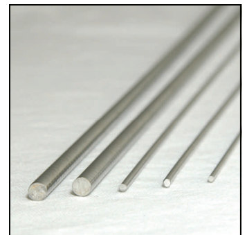
Straight and Cut Wire

For pricing or further information regarding Specialty Products please contact: