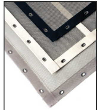
Nomex, Canvas, PVC edges

Replacement accessories also available for your Rotex Separators