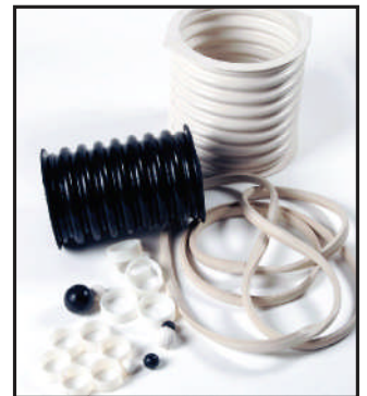
pretension screener accessories