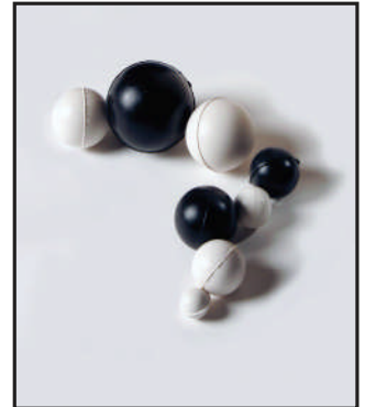
mesh cleaning balls