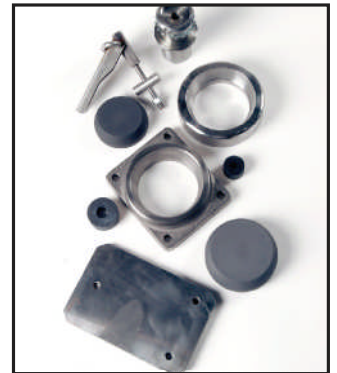
machined Rotex parts