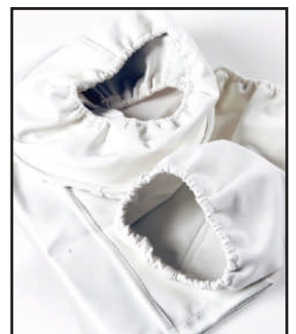
custom RCN sleeves